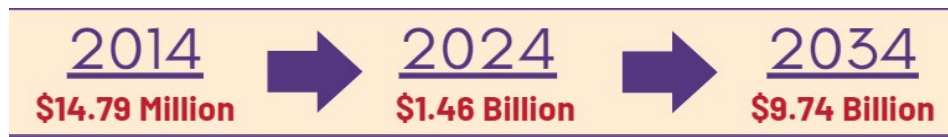
Cumulative Voucher Appropriations 2014 - 2034

Total spending on vouchers since the program launched in 2014 will exceed $1 billion in 2024. By 2034, North Carolina will have spent nearly $10 billion on vouchers. Every penny spent on private school vouchers could instead be used to better fund public schools that serve ALL students.